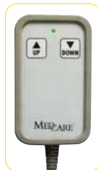
Hand Control Item # 400990