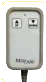
Hand Control Item # 400990